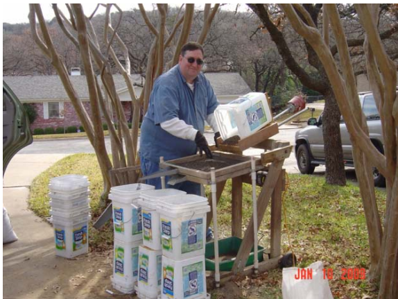
Last year's event.