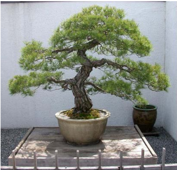
Japanese Black Pine –National Collection

As usual, if you don't want to participate in the class, you may bring a tree to work on and get help from other club members without paying any fee.