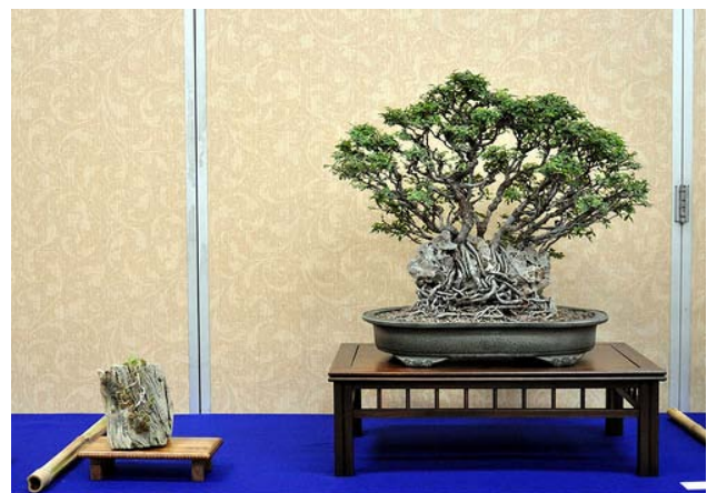
Root-Over-Rock Chinese Elm Clump

I have attended numerous bonsai conventions, including the first World Bonsai Federation Convention, in April, 1989, in Omiya, Japan.